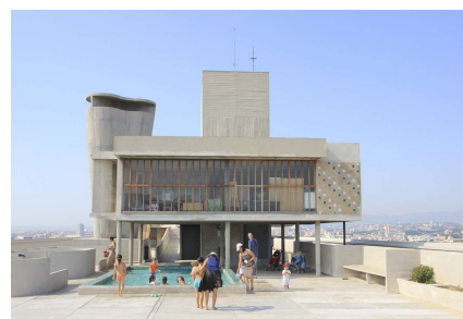
Unite d'Habitation