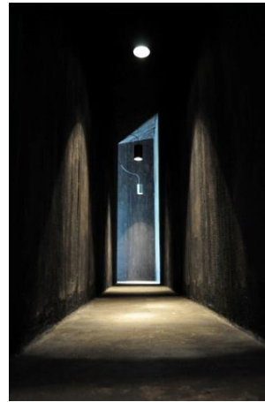
Serpentine Gallery Pavilion 2011 by Revti Halai

Neil Dusheiko , Director of Neil Dusheiko Architects, won the Architecture and People category with his picture of 'Unite d'Habitation', the modernist residential housing design developed by Le Corbusier. The Unite d'Habitation is a courageous architectural experiment, borne out the architect's believe that a buildings social program can positively alter the way people live. The Unite is a utopian vision of the Garden City model for realized in an urban context.