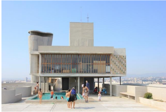
Unite d'Habitation by Neil Dusheiko