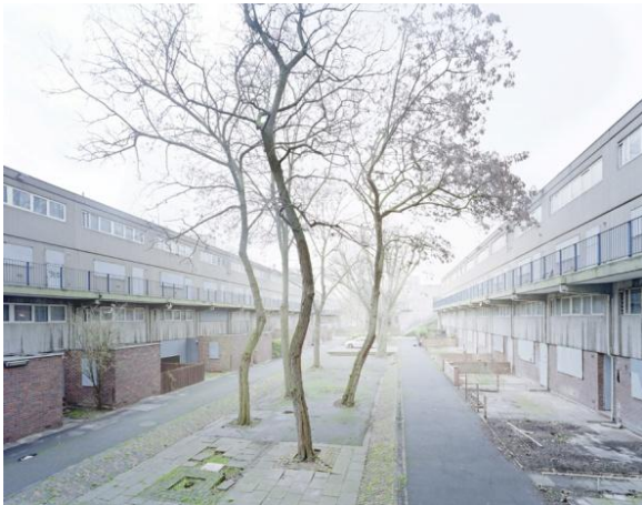
Heygate Estate